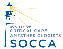
Exhibit & Sponsorship PROSPECTUS